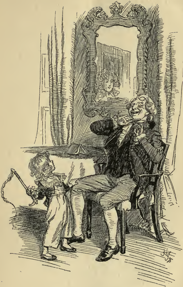
His son's son, a child of four years old.